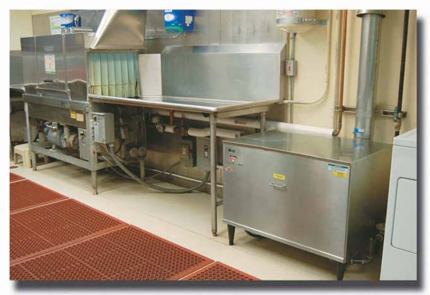
Oregon's Salem-Keizer Public Schools replaced costly to operate electric boosters with compact, energy-efficient Vanguard PowerMax™ 200 gas booster heaters (shown at right) that reliably provide 180°F sterilizing rinse water to the kitchens' dishmachines.

vigilantly monitors energy usage throughout the system, researching opportunities to conserve energy and lower costs. As a measure of his accomplishments he was named Energy Manager of the Year 2007 by the Association of Professional Energy Managers of Oregon. "We're especially proud to be recognized for being fiscally and environmentally responsible," he says.